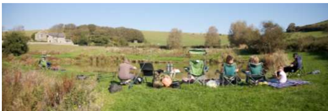
Picture 9 Fishing on a farm

Source: http://www.nettlecombefarm.co.uk/fishing/36/T&Cs.php