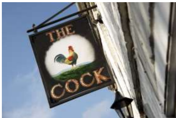
Picture 15 Pictorial sign of the Cock pub

Nowadays, names of the pubs are related with alcohol (Barrels), animals (Guide Dog), colours (Red Lion), food (Ribs of Beef), occupations (Plumber's Arms), location (Bedford Arms), historic events (Festival Inn), literature (Sherlock Holmes), myths and legends (Black Horse), plants and horticulture (Flower Pot), jokes (Cock and Bull), pubs itself (Hole in the Wall) and many others. ( http://en.wikipedia.org/wiki/Pub_names )