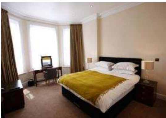
Picture 2 Glenlyn Guest House bedroom