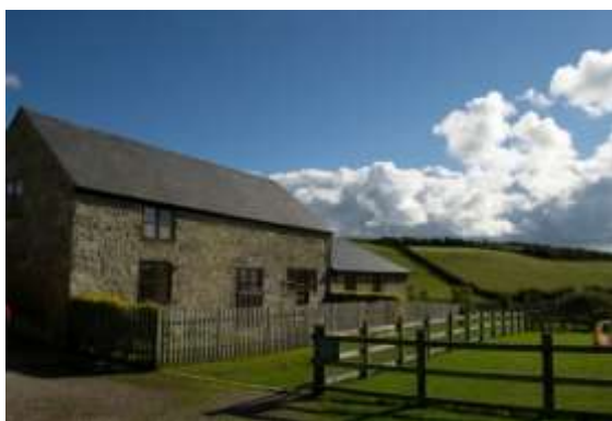
Picture 10 Converted grain storage barn

Source: http://www.nettlecombefarm.co.uk