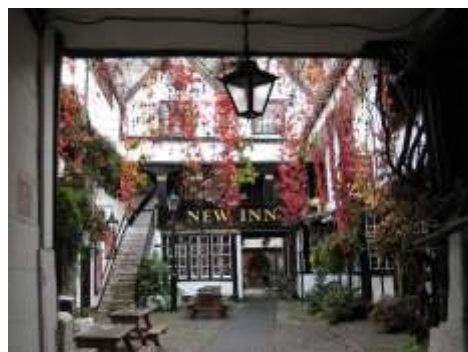
Picture 7 The New Inn

Source: http://www.georgeinnsp.co.uk/home