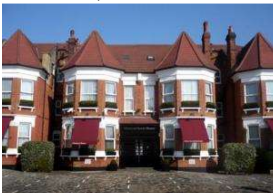
Picture 1 Glenlyn Guest House