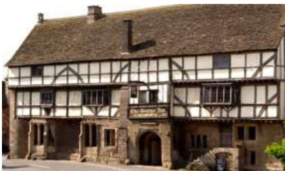
Picture 6 The George Inn