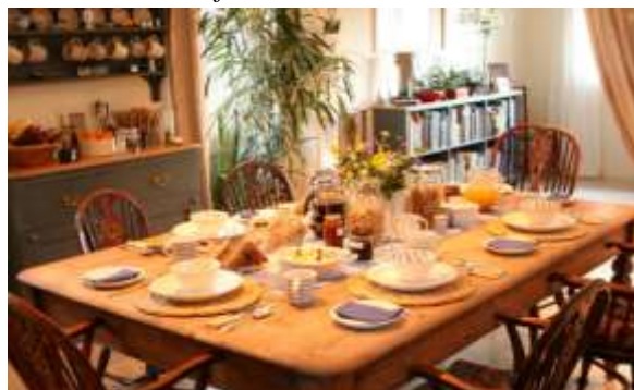
Picture 4 Breakfast in B&B