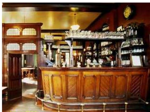
Picture 17 Bar in the Castle