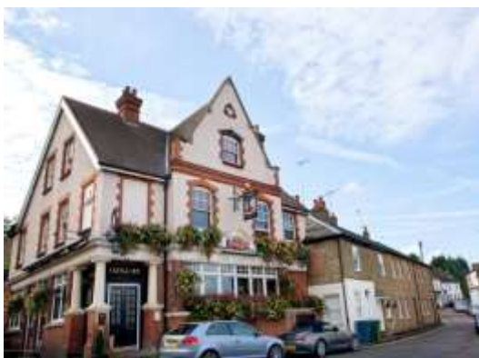
Picture 16 The Castle pub