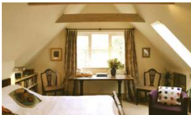
Picture 5 Bedroom in a Church House B&B

Source: http://www.churchhousebandbsuffolk.co.uk