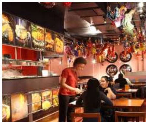
Picture 13 Indian restaurant

Source: http://circus-london.co.uk/gallery.ph