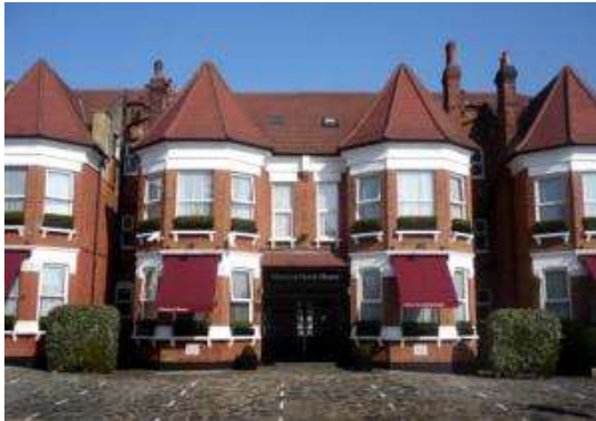
Picture 1 Glenlyn Guest House