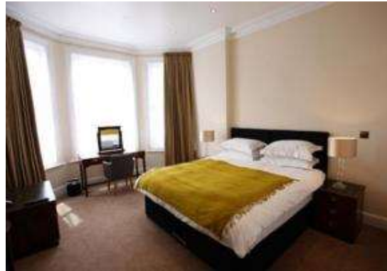
Picture 2 Glenlyn Guest House bedroom