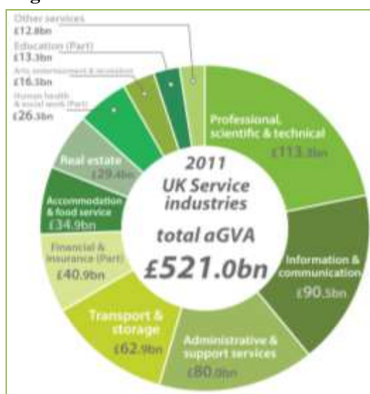
Figure 2 Service Industries